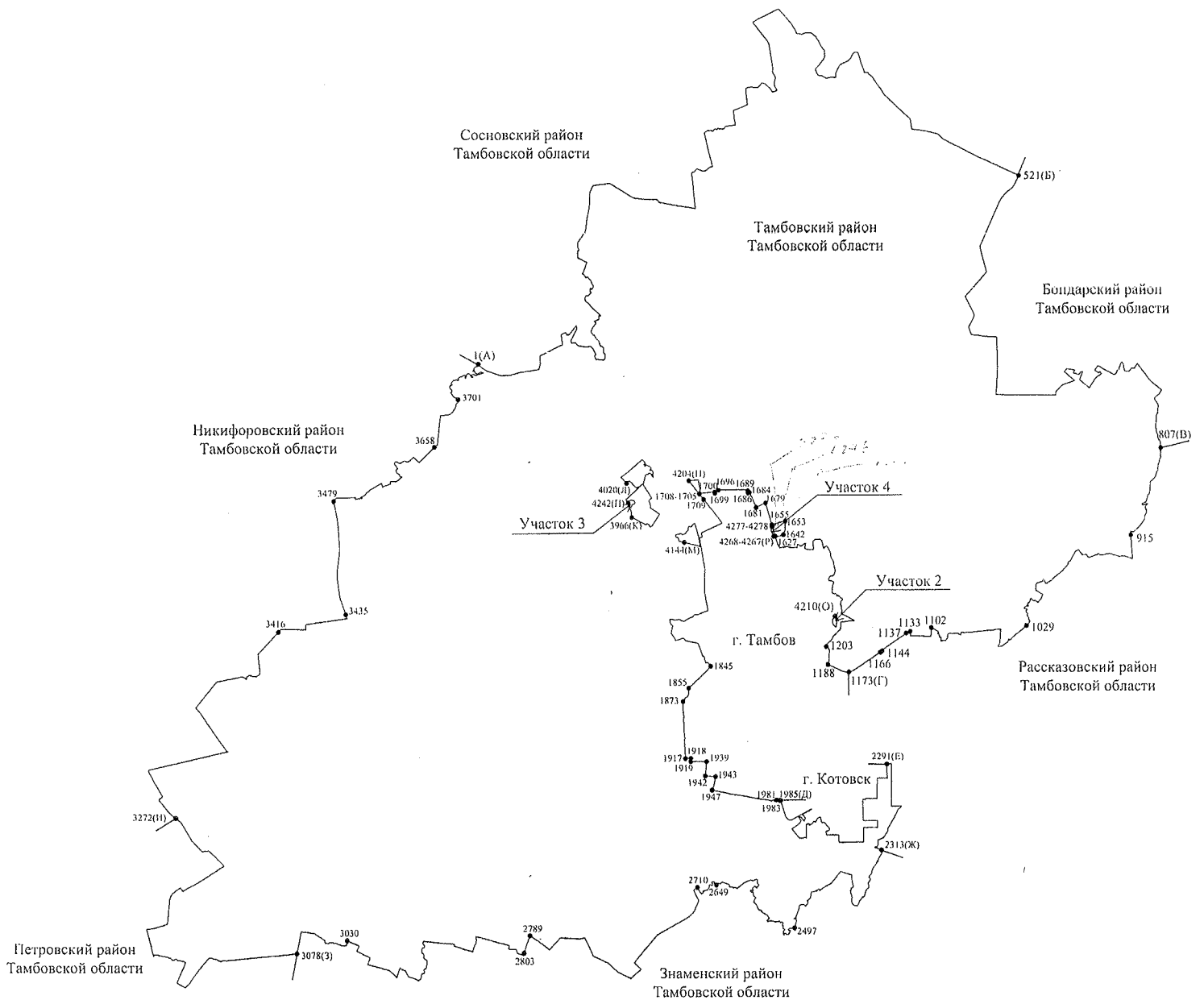
Схема границ муниципального образования - Тамбовский район Тамбовской области

«Приложение 1 к Закону Тамбовской области «Об установлении границ муниципальных образований Тамбовского района Тамбовской области и определении места нахождения их представительных органов и о признании утратившими силу отдельных положений некоторых законодательных актов Тамбовской области»