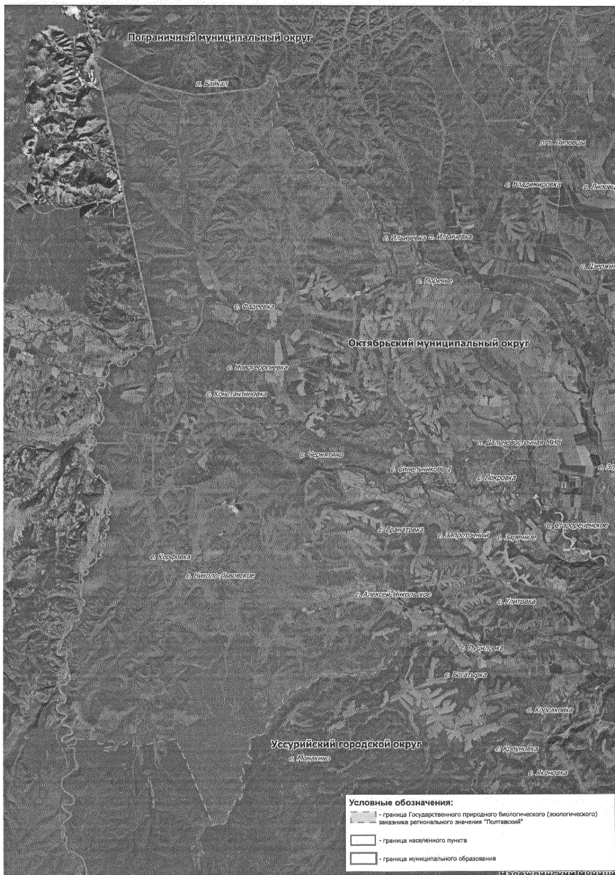
СХЕМА ТЕРРИТОРИИ ЗАКАЗНИКА

к Положению о государственном природном биологическом (зоологическом) заказнике регионального значения «Полтавский»